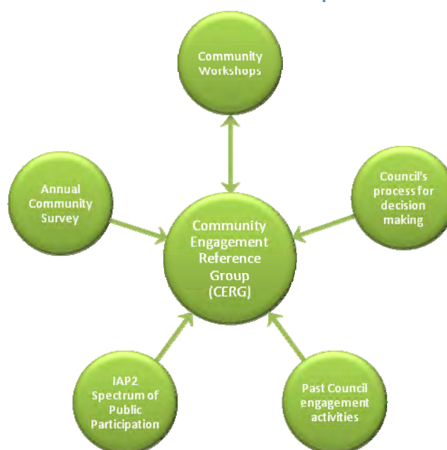
Figure 1: CERG Information and discussion process

With 44 residents attending one of four workshops across Hume; the workshops aimed at gathering broader community input into the development of the framework, while providing CERG members with a firsthand experience in undertaking a community engagement activity. Community input and learning's from these workshops were then discussed by CERG members to inform the development of the framework.